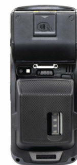
Finger print (4000mAh battery)