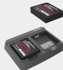
Dual-Slot Battery Charger